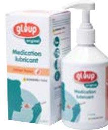
Gloup Original Orange 500ml Level 3 Moderately thick