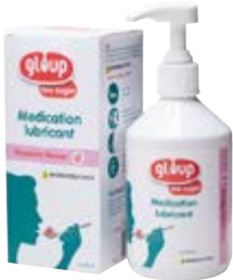
Gloup Low Sugar Raspberry 500ml Level 3 Moderately thick

Over 50% of Aged Care Facilities are now using Gloup® to benefit their residents