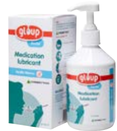
Gloup Original Vanilla 500ml Level 4 Extremely thick