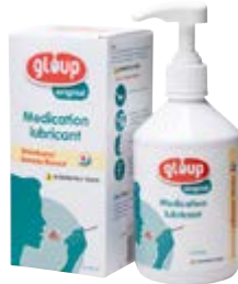
Gloup Original Strawberry/Banana 500ml Level 3 Moderately thick