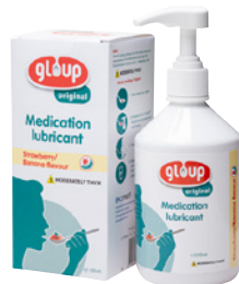
Gloup Original Strawberry/Banana 500ml Level 3 Moderately thick