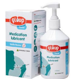
Gloup Original Vanilla 500ml Level 4 Extremely thick