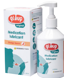
Gloup Original Orange 500ml Level 3 Moderately thick