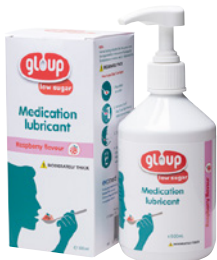
Gloup Low Sugar Raspberry 500ml Level 3 Moderately thick

Over 50% of Aged Care Facilities are now using Gloup® to benefit their residents